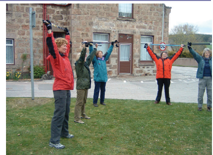
Nordic Walking Training Course

New Volunteer Leaders continue to come forward, and we hope that public funders and policy decision makers appreciate the level of delivery of key government targets on public health that are being achieved overwhelmingly by volunteers within the Cairngorms National Park and surrounding area.