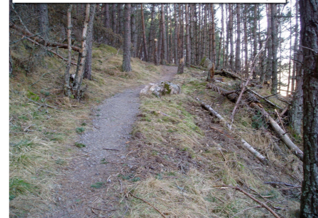
The Lion's Face path reopened after storm damage

UDAT was also able to repair the Lion's Face path near Braemar, which had been closed due to storm damage.