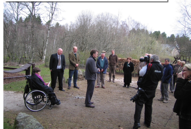
Opening of Clarack Loch path and launch of COAT